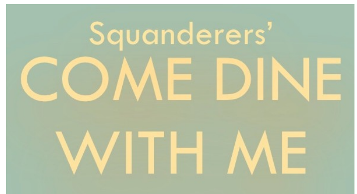
Figure 3 Coming soon via a live twitter feed near you

Using advanced quantitative estimations, Figure 2 shows there is strong indication that performance correlates with social activities. Further investigations are to be carried out to corroborate our findings and novel advanced techniques such as Brewery tours and "Squanderers come dine with me" will be used (Figure 3). It is hoped that such social activities will lead to positive results both on and off the pitch, and with the return of Mr. A. Bird, an expert in optimising the social performance of homo sapien squanderae as well as fixing tractors, it is very likely that such targets will be achieved. After a turbulent first week, but a much better second,